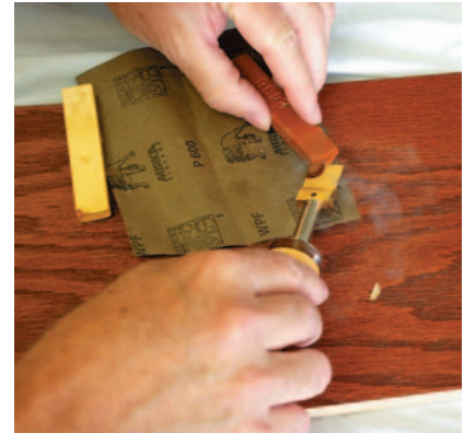
Burn-in stick should be as close as possible to exact color.