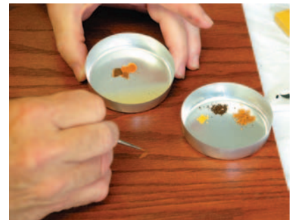
Powders allow precision with color matching and application techniques.