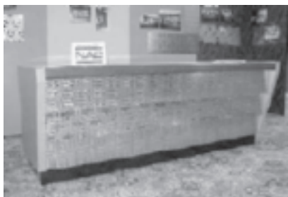
Examples of Pacific Crest decorative metal installations.

scratch resistance, resistance to graffiti from felt pens and spray paint, and no clouding or yellowing when exposed to sunlight.