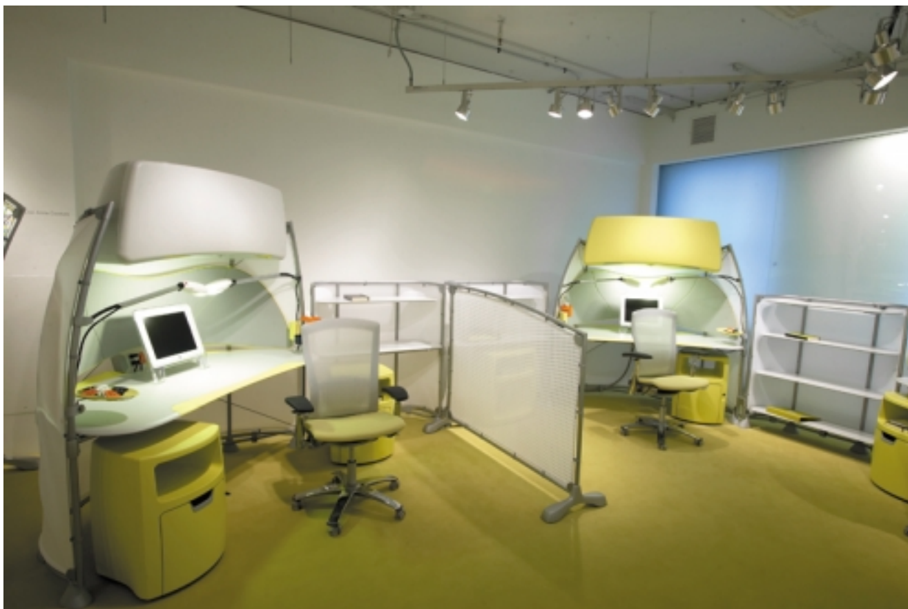
The A3 office system is designed to enhance comfort and create a dynamic and responsive workplace.