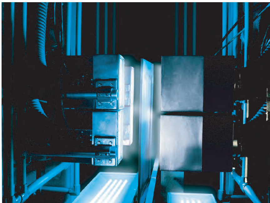
The powder coating is cured by passing the product between banks of microwave-generated UV light.

powder coatings—so it’s a double leap in technology for them. It can be daunting and a ‘seeing is believing’ experience is critical in bridging the confidence gap.” ▸