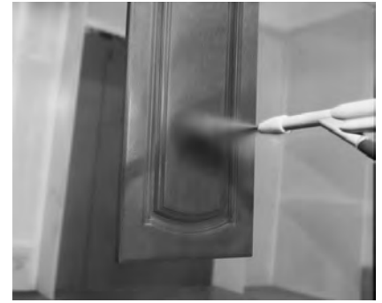
Application of UV-powder coating.

The economic slowdown has delivered a one-two punch to the UV-powder segment. First, and most obviously, there are fewer immediate prospects. Fewer customers are willing to fork over the money for a large capital investment especially when there's often surplus capacity on existing finishing lines. The arguments