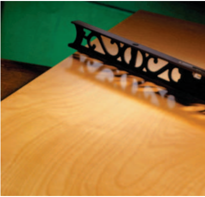
UV-coated panels, clear and stained, are among the fastest-growing segments of the hardwood plywood industry.