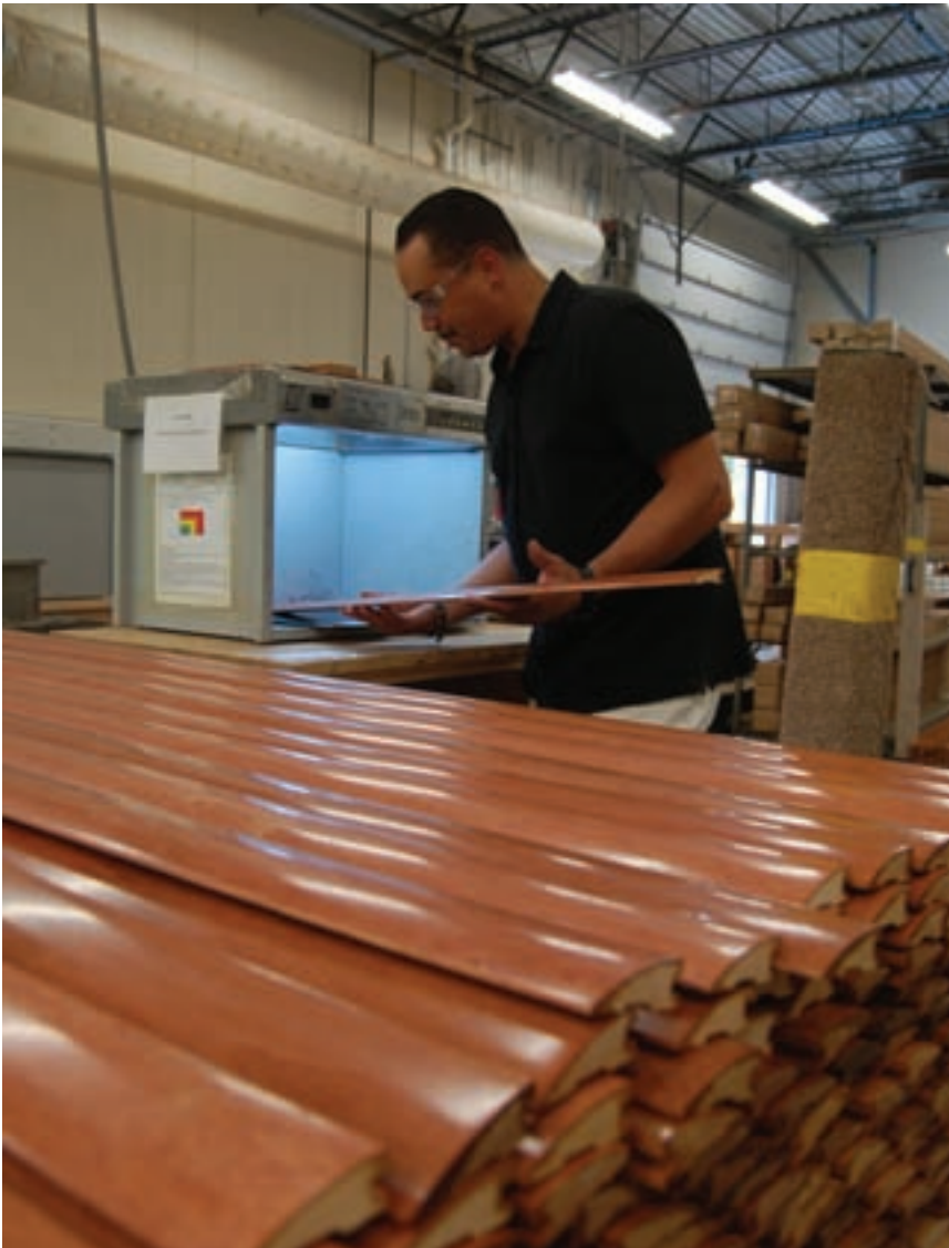
Careful inspection and quality control assure that production parts match customer samples.

When Coxen's father started the business in 1942, it specialized in