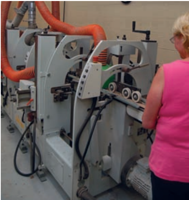
Automated sanding permits uniform coating on complex shaped moldings.