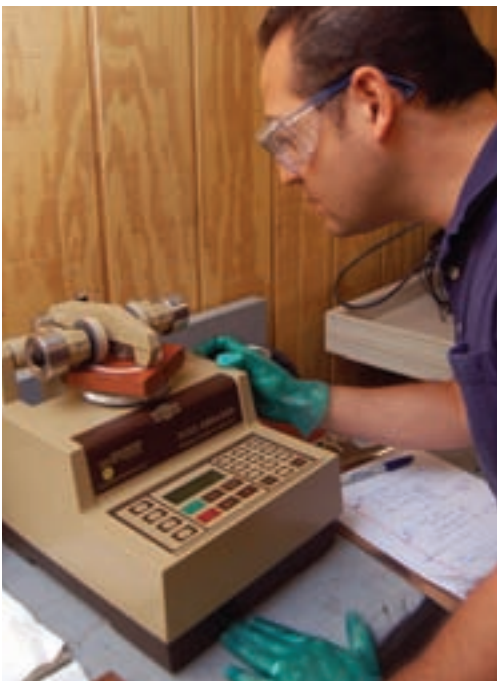
Pennwood’s coatings are tested against stringent performance standards.