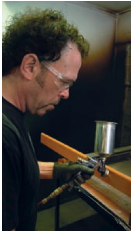
Hand spraying new formulations of UV coatings and stains in the lab.

Supporting the production facility, a specialized color matching and test laboratory allows Pennwood to develop new finishes to match nearly any shade or texture of hardwood flooring with pinpoint accuracy. A fully equipped coatings test laboratory performs cosmetic and functional tests such as spectrophotometry and Taber abrasion to assure that the coated wood parts meet demanding customer