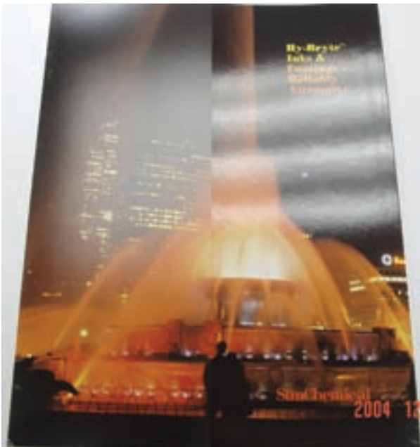
Photo 1 —Printed brochure showing effect of glossback. This brochure was printed specifically to demonstrate the glossback effect and the quality of the hybrid technology. The cover uses a half page which folds over on itself. The two opposing halves of the image are actually on the same side of the sheet of paper. To print this brochure, an eight-color press was used in which four colors of conventional sheetfed ink and four colors of hybrid ink were printed during the same pass. The entire sheet was flood coated with a UV coating and the entire job was UV cured.

Over the years, a few printers tried to print both conventional inks and UV inks on the same piece of