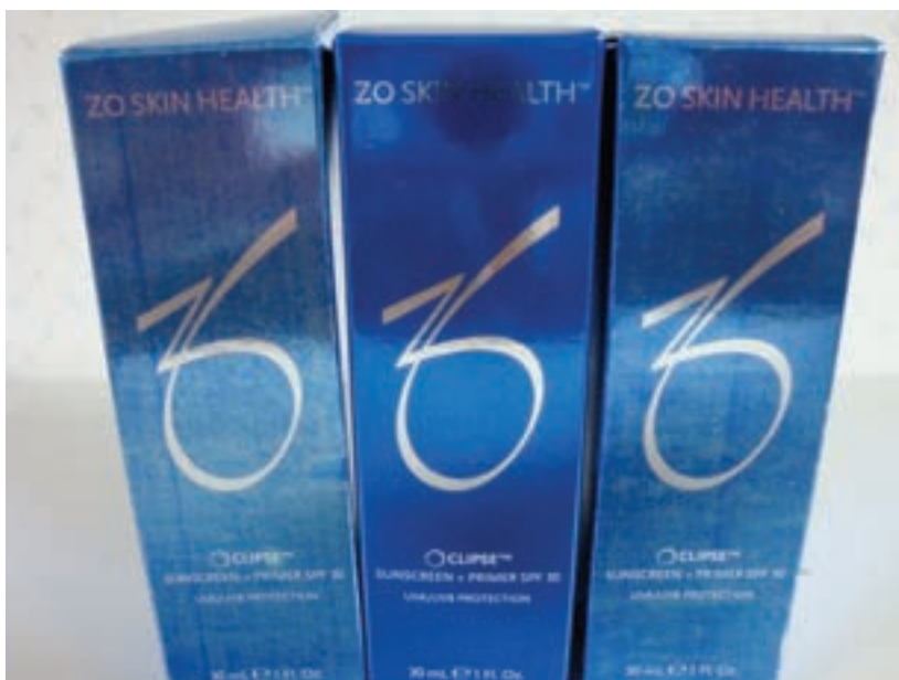
Photo 2 —Effect of pigment burnout due to UV coating. The middle carton in the photograph is the correct carton while the carton on either side shows the effect of the pigment burning out due to the effect of the UV coating. Although this situation can be corrected with another coating, the root cause is the improper pigment selection.

However, there are several significant drawbacks to this approach. First, the printer must wait for the inks to dry adequately enough that (when the UV coating is applied) it does not