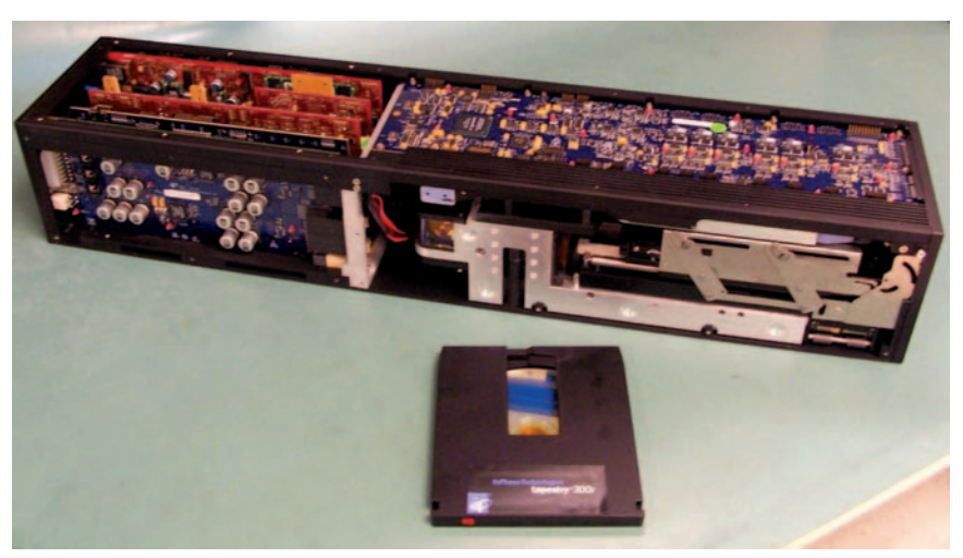
Holographic recording system.

difference between the refractive indices of the photopolymerizable component and the matrix.