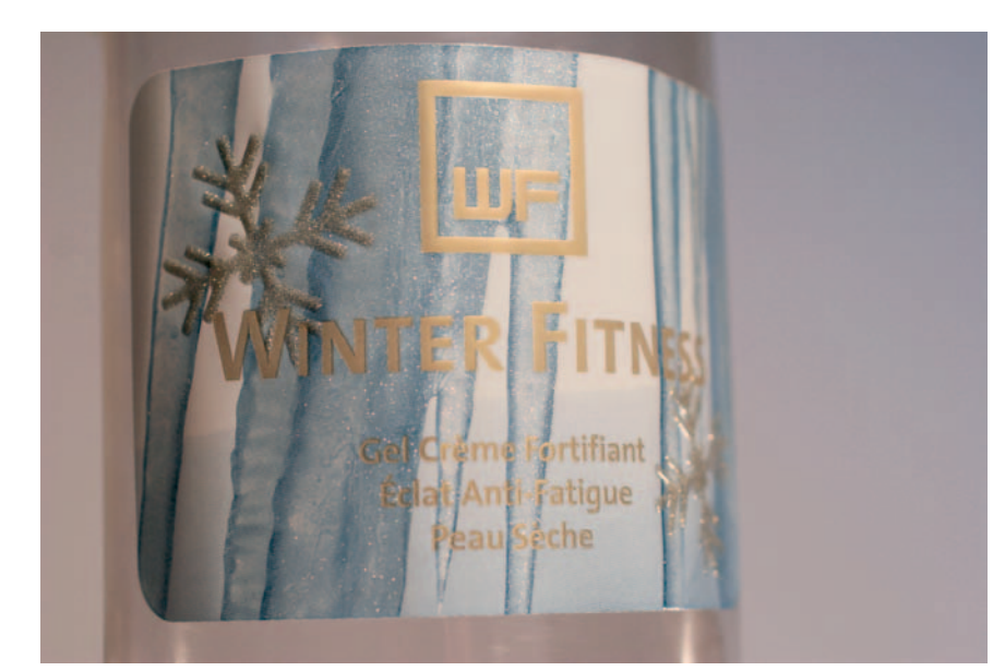
UV-based ink printed with metallic and pearlescent effects.

For example, with ceramic inks, to create a special "transparent window" effect onto an acid matte glass surface, it is necessary to first print a mask onto the glass surface and then use a special etching process to get a "clear transparent window" onto a matte finish. With UV-curable inks, the manufacturer can simply print this