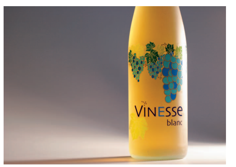
UV-based ink printed wine bottle.

Since the debut of UV-based inks for the decoration of glass and ceramics more than six years ago, glass and ceramic printers have enjoyed the benefits of switching from ceramic-and solvent-based inks to organic UV-based inks. Users have benefited from an increased high-gloss level, lead-free formulations, chemical and dishwasher