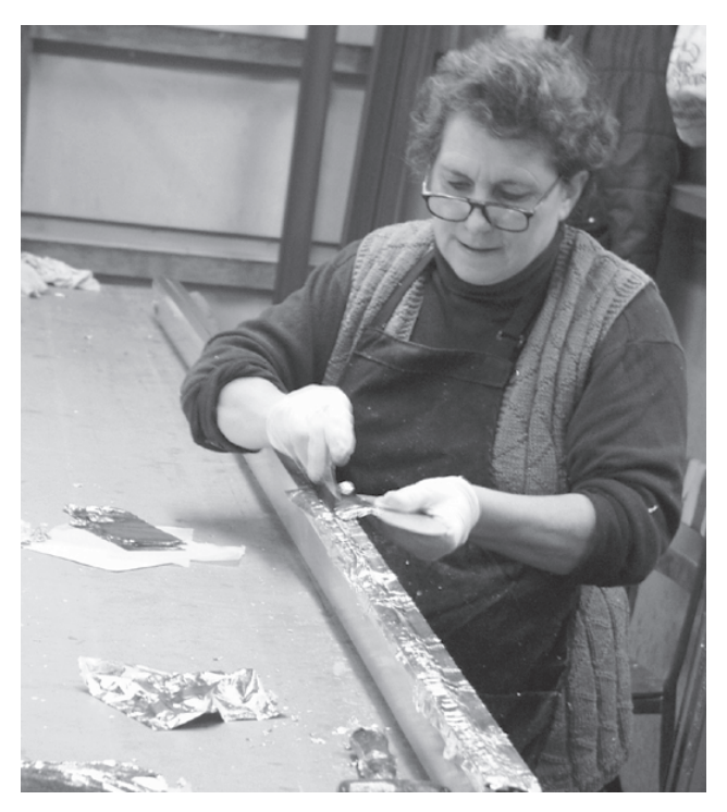
PB&H specializes in hand finishing, but a UV clearcoat was an excellent solution to a big bottleneck.

about replacing the other lamps. We could use the existing ballasts for the 55" lamps in the control cabinet with two 25" lamps wired in series. We now had the option of having seven light sources. We started with one pair mounted on either side of the first bottom lamp and this solved problems with getting cure around the bottom-back and rabbet sides of the moulding. Over the next couple of