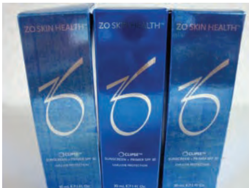
Photo 2 —Effect of pigment burnout due to UV coating. The middle carton in the photograph is the correct carton while the carton on either side shows the effect of the pigment burning out due to the effect of the UV coating. Although this situation can be corrected with another coating, the root cause is the improper pigment selection.

However, there are several significant drawbacks to this approach. First, the printer must wait for the inks to dry adequately enough that (when the UV coating is applied) it does not