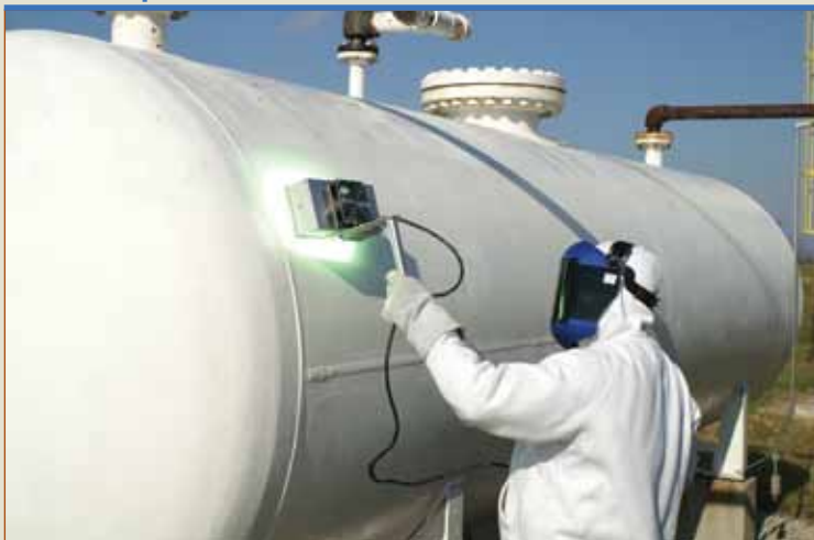
Field application and cure of UV technology at cold temperatures